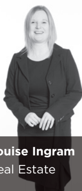
Louise Ingram Real Estate