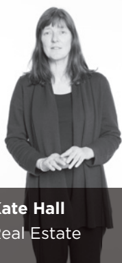
Kate Hall Real Estate