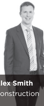
Alex Smith Construction